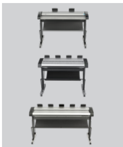
Your choice of scanner IQ Quattro X 44 inches HD Ultra X 42 inches HD Ultra X 60 inches