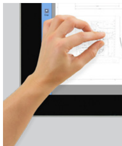
Touchscreen Full HD 21.5" touchscreen