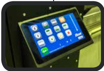
LCD Touch Screen Display