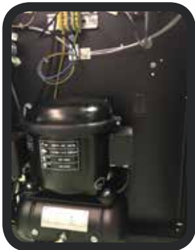
Silent compressor inside the machine