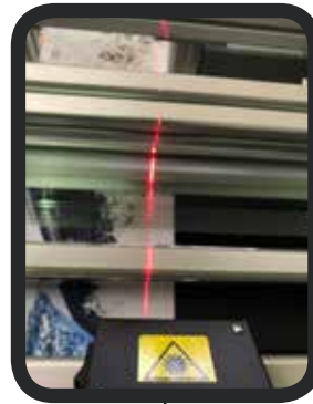
Laser ray for vertical cut (optional)