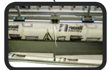
Double central cutting units (optional)