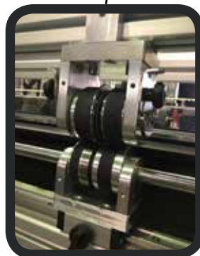
Vertical cutting units